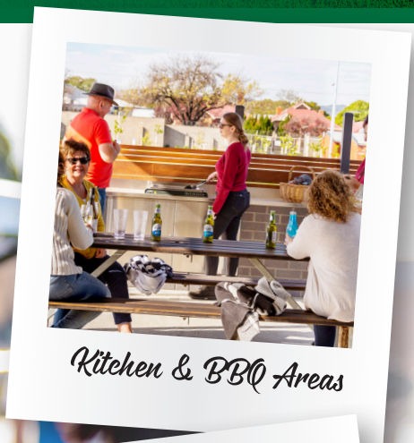
Kitchen & BBQ Areas