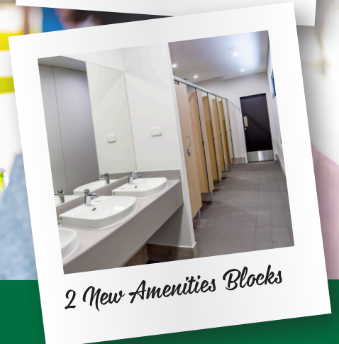
2 New Amenities Blocks

CITY FRINGE LOCATION, CONVENIENT PUBLIC TRANSPORT • FREE high speed WiFi • Easy online booking • Contactless Check In • Fire Pit